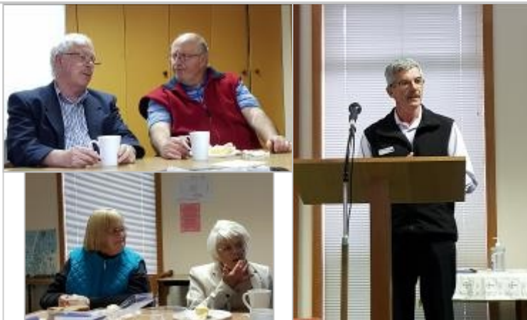
Above: GT Combined Christian Churches service in Chaplaincy Week

Newsletter deadline for photos, articles, etc. is 20th of each month unless otherwise stated